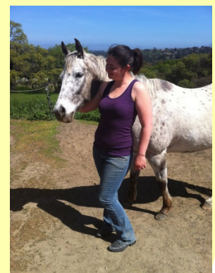
Gabbi with Twilight

Volunteering at B.O.K. is one of the most rewarding experiences of my life. I have met some truly amazing people (instructors, volunteers, riders and their families) I enjoy creating strong evolving bonds with the students and horses. Each rider is unique and faces their own distinct challenges as well as having their own individual strengths. Watching the students overcome obstacles has been incredibly gratifying. They work hard each lesson to gain confidence and skill in riding. Riders bond with their horse and progress towards their goals each time they ride. The skills learned by students in the arena and on the trail help them to not only become better riders but also enriches their lives off the horse. The B.O.K. horses are amazing themselves. They are giving these children and adults invaluable experiences. Each horse has its own personality and over my time at B.O.K. I have formed my own bonds with each horse in the barn. Watching the riders get excited to see all the horses and ride their horse each week is wonderful. The progress made with the aid of a connection with a specific horse is astonishing. The horses and people I have met are truly special. I am thrilled that I found B.O.K. and I hope to continue to learn and grow along with the riders as a volunteer at B.O.K. in the future.