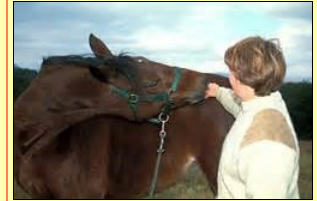
Carrot stretches improve flexibility

Carrot Stretches - There is no limit to the head and neck stretches possible with treats! Lure the horse into position, hold, then give the treat and release. Some possible carrot stretches are: stretching towards the hip, the girth, the stifle, the elbow, and the chest (arching the neck), straight up and out (as if the horse were eating from a tree), and between the front legs. These stretches improve strength, flexibility, and range of motion in the horse's neck and poll.